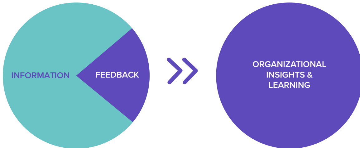
Figure 1. Feedback: One Input Into Organizational Learning

manifest in multiple forms. A lot of feedback—in fact, the bulk of what we as people and providers respond to—is not perceptual. Rather, it comes to light through constituents’ actions and behaviors.